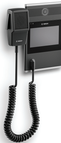
PRA-CSLW with hand-held microphone

This call station for use in PRAESENSA Public Address and Voice Alarm systems is easy to install and intuitive to operate because of its touch screen LCD, providing clear user feedback about setting up a call and monitoring its progress, or controlling background music.