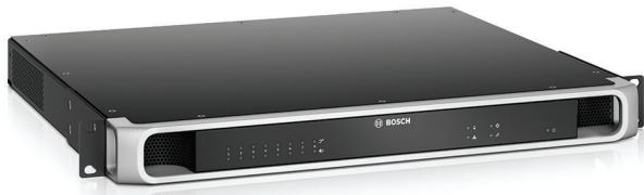
PRA-AD608 with 8 channels

This is a flexible and compact multi-channel power amplifier for 100 V or 70 V loudspeaker systems in Public Address and Voice Alarm applications. It fits in centralized system topologies, but also supports decentralized system topologies because of its OMNEO IP-network connection, combined with DC-power from a multifunction power supply. The output power of each amplifier channel adapts to the connected loudspeaker load, only limited by the total power budget of the whole amplifier. This