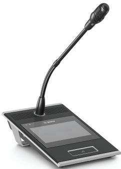
PRA-CSLD with gooseneck microphone