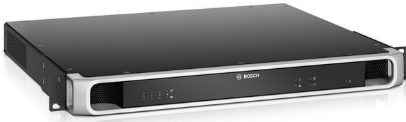
PRA-AD604 with 4 channels